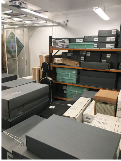
Objects were received in large intakes of similar objects to support efficiency and reduce costs.