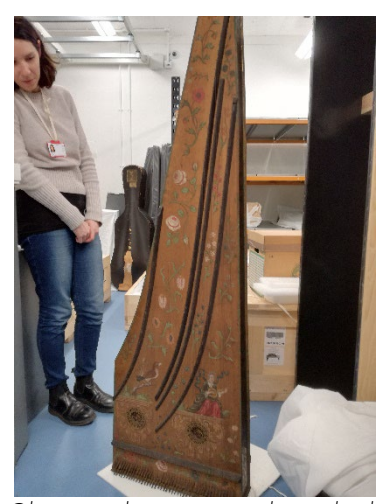
Objects underwent a condition check to compare against previous reports, generate new documentation and identifying information, and to ensure no damage or losses had occurred during storage or transport.