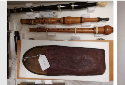
Flageolets from the Douglas MacMillan collection