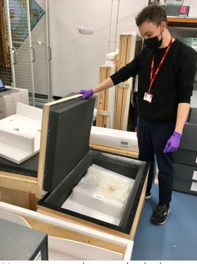
Housing materials were checked, reused or recycled to support sustainability.