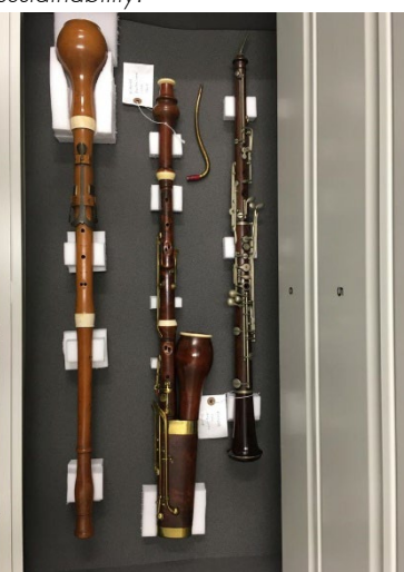
Example wind instruments housed in custom mounts, and placed into drawers in the rolling stacks.