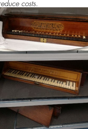
Keyboard instruments mounted on static shelving units.

In July 2021, we audited Museum holdings at our storage location in Deep Store (Winsford, Cheshire), improving documentation on areas of the collection with little information, and identifying items for retrieval to the Wolfson Centre.