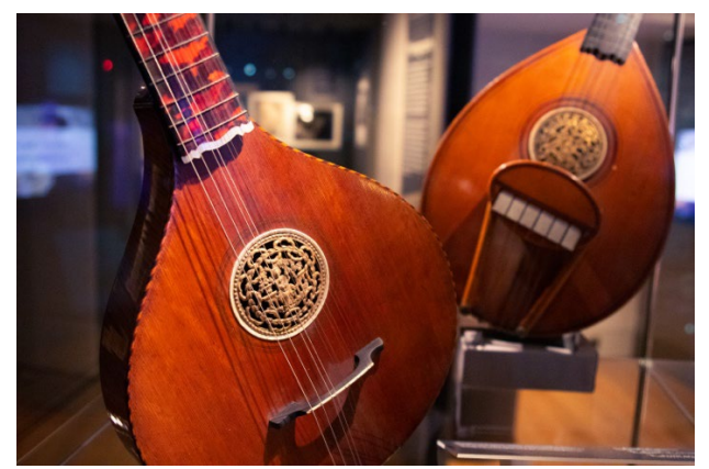
Instruments in the Hidden Treasures of the RCM exhibition.

The final element of the redevelopment consists of the launch of the new Wolfson Centre in Music and Material Culture, situated in the South Building in a climate-controlled space that has been partially purpose-built and fitted out in collaboration with Bruynzeel Storage Solutions. The Centre includes dedicated spaces for consultation, study and digitisation; conservation; object-based learning and climate-controlled intensive storage to make the collections available to internal as well as external researchers and classes by appointment.